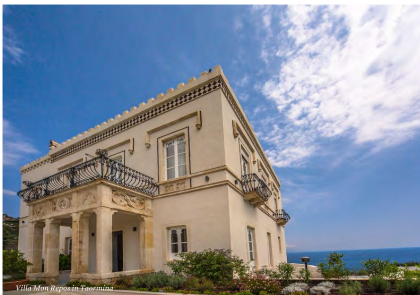
Villa Mon Repos in Taormina

residenzavillamonrepos@gmail.com toutv.com