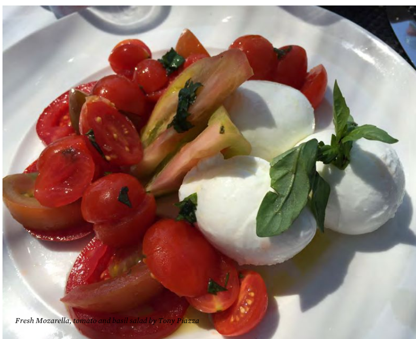
Fresh Mozzarella, tomato and basil salad by Tony Piazza